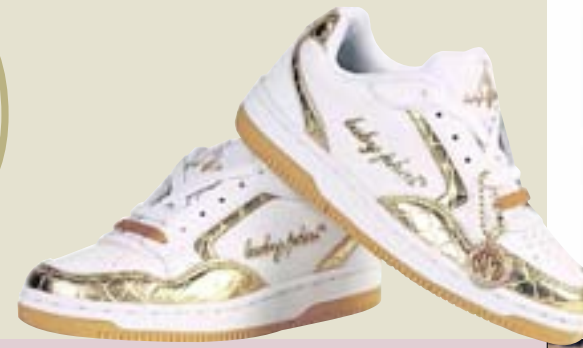
Baby Phat Diva sneakers $72 At d.e.m.o.

Fortunately, you don't need mad flow to get today's sexy, powerful