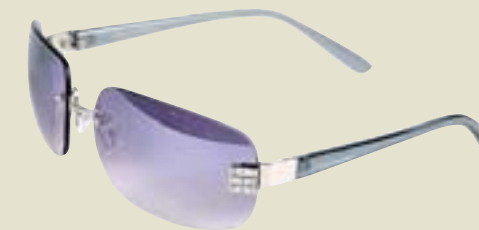
Steve Madden sunglasses $30 At Meier & Frank

Michelle DeCourcy strapless silk dress $279 At Michelle DeCourcy / Gold satin "Boomtown" evening sandals $59.99 At Nine West / Multi-layered gold necklace $15 At Aldo / Gold hoop earrings $18.50 At Guess / She & Josh gold evening bag $24 At Blush Beauty Bar